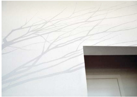
Oona Culley Memory Traces (with trees)