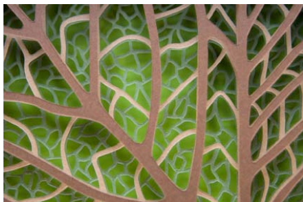
Chisato Tamabayashi Untitled